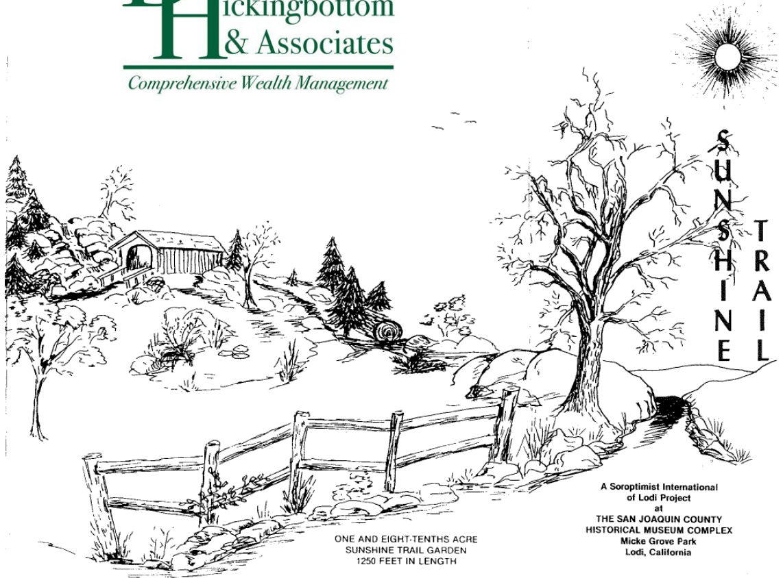
ONE AND EIGHT-TENTHS ACRE SUNSHINE TRAIL GARDEN 1250 FEET IN LENGTH

The Sunshine Trail is a garden designed especially for the enjoyment of visitors with impaired vision. In 1,250 feet, it recreates a trip across California from west to east and includes water features, bridge's, native stone, and most importantly, native California plants especially selected to be explored by senses other than sight.